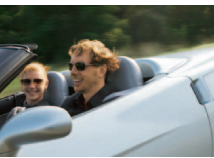
Clockwise from above: Dax Shepard's crossed-flags tattoo is no decal — the guy is wild about Corvette performance; arriving in style at the luxurious Biltmore; Dax strikes a pose that leaves passersby howling; on the way up winding San Marcos Pass with girlfriend Briegh Morrison.

smiling broadly again. In one concise moment he has shown with crystal clarity the duality of being an actor and a superb driver. Amazingly, this matches the dual nature of the Corvette — plush and exquisite to look at, brutishly powerful when called upon. It's the perfect beginning for Dax's ultimate weekend.